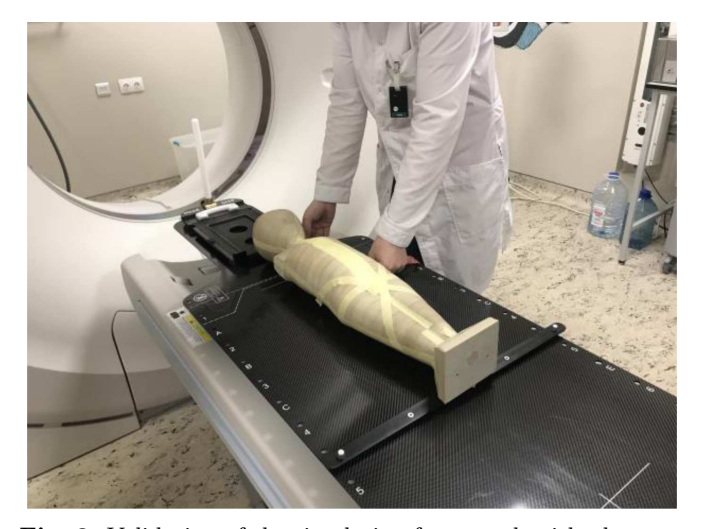
Fig. 2. Validation of the simulation framework with phantom measurements.

Further research will be aimed at improving the simulation speed of out-of-field dose computations in PRIMO, as well as expanding PRIMO capabilities to include proton beams. Research is also being conducted in the direction of improving the analytical models used for the computation of the out-of-field dose in photon [59] and proton treatments.