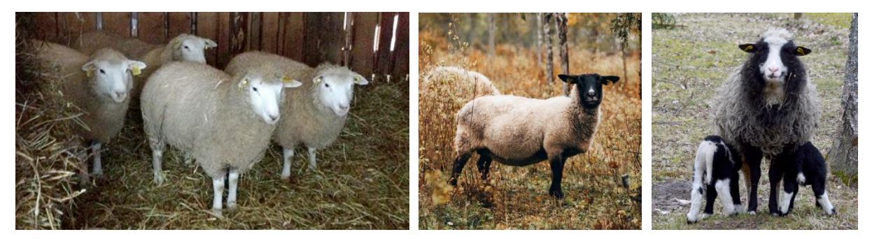
FIGURES 1, 2 AND 3. The Estonian Whitehead sheep (Figure 1). The Estonian Blackhead sheep (Figure 2). The Kihnu native sheep (Figure 3).

Three Estonian and three Norwegian sheep breeds were selected, their wool was collected and yarn and woven and knitted textiles were made from the wool. The Estonian sheep breeds were the Estonian Whitehead (EV, Figure 1), Estonian Blackhead (ET, Figure 2) and the Kihnu native sheep (KM, Figure 3). These breeds were chosen because Whitehead and Blackhead are historical Estonian sheep breeds and Kihnu native sheep are the oldest local breed.