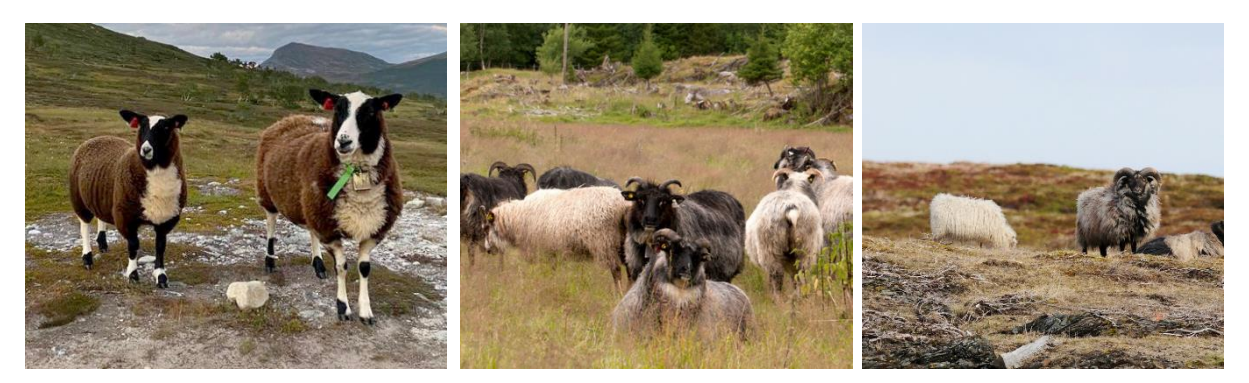
FIGURES 4, 5 AND 6. Blæset sau (Figure 4, photo by M. Espelien). Old Norwegian Short-Tail sheep (Figure 5, photo by A. Espelien). Old Norse sheep (Figure 6, photo by A. Espelien).

In the context of the following testing, it is important to note that three of the six sheep breeds included in the project have single-coated wool (the Estonian Whitehead sheep, Estonian Blackhead sheep and Blæset sau) and three have double-coated wool (the Kihnu native sheep, Old Norse sheep and Old Norwegian Short-tail sheep).