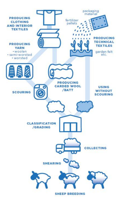
FIGURE 7. The stages of wool processing

The complete chain of wool production encompasses the journey of wool from shearing to finished product. Figure 7 shows the stages of wool processing in a simplified way. Although all the processes are the same, the roadmaps of wools at different sizes of production are slightly different. While, in large-scale production, many steps are carried out in various industries, which may be located far away from one another in different countries and the wool moves long distances from one place to another, the small-scale production chain is much more localised, and many of the processes are carried out within the same company.