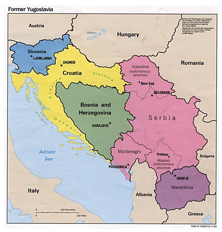
Figure 1Former Yugoslavia – political map.

"Yugo" means "southern" in Slavic language. This language is also what the groups in this area