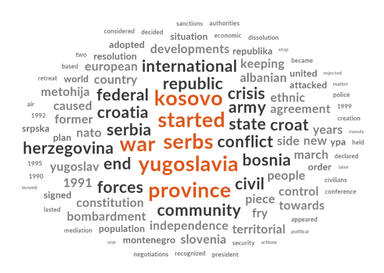
Figure 3 Word cloud from Serbian history textbooks about the Yugoslavian War

the focus and narrative in the text. The focus is to explain "why?", giving reasons for the Yugoslavian war. It is more than less a chronological story from the Yugoslavia's dissolution, hyphening Albanians' role in Kosovo, and the demographic and geographic impacts the war had for Serbia. An analysis of why Kosovo are taking up so much space in the Serbian narrative, is that Kosovo has a particular important role in the Serbian identity and that this war was lengthy and at its ending, marked the end of the Yugoslavian war. Andersons describe the nation being imagined by cultural artefacts like language , maps , and literacy . In this perspective, the loss of an important geographic territory as Kosovo is for Serbia, may be perceived as losing their imagined community (Anderson, 2006).