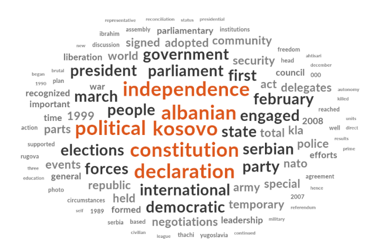
Figure 2 Wordcloud from Kosovo history textbooks about the Yugoslavian war

A word count from each history textbook gives a good impression of each side's focus and main narrative. Suppose nations are, as Anderson (2006) claims, the product of the imagined community; identifying the focus may also give an insight into what kind of nations Kosovo and Serbia perceived themselves as.