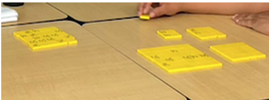
Fig. 1 Squares and squared numbers (and other elements).