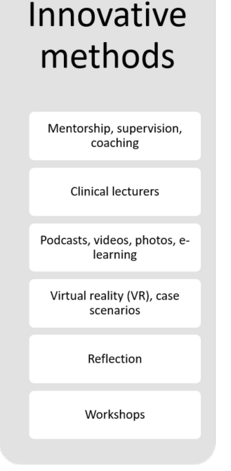
Figure 1 Themes regarding the development of a midwifery newborn resuscitation course.