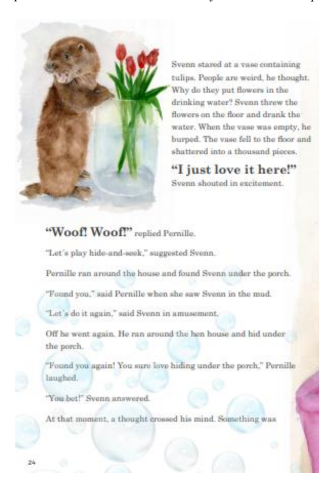
Spread 9 – Svenn's encounter with a flower vase and a pink basin

This image also establishes relationships between the represented participants and the reader in terms of what the image and the verbal text communicate. The proximity between Svenn and the children denotes a personal relationship between them. The visual resources, such as the kneeling of the children and their body language, also allow the reader to understand the power dynamics among the participants. In this case, the fact that the children are kneeling and in proximity to Svenn, may communicate a need for contact and closeness.