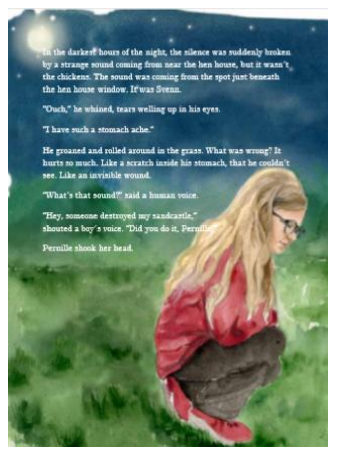
Spread 6 – The relationship created between Svenn and the Children