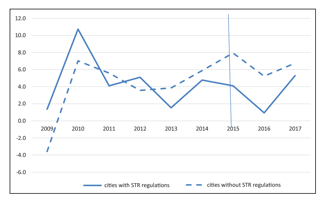
Figure I. Evolution of overnight stays for cities with and without strict regulations on STRs. STR: short-term rental.

Note: CEM: coarsened exact matching. The strata are calculated using STATA's 'CEM' command (Blackwell et al., 2009).