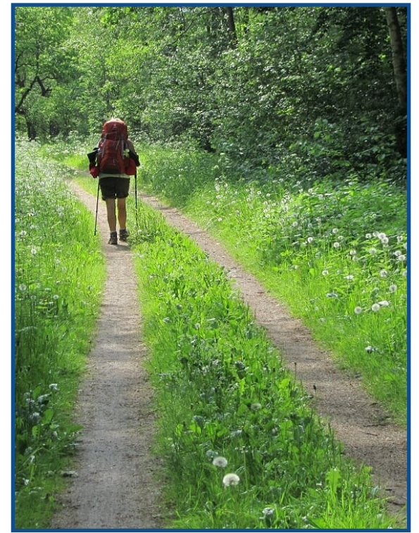
Michael Schildmann, 2013

Figure 7: 'Self-immersing' / 'nature bathing' through the many woods along the route