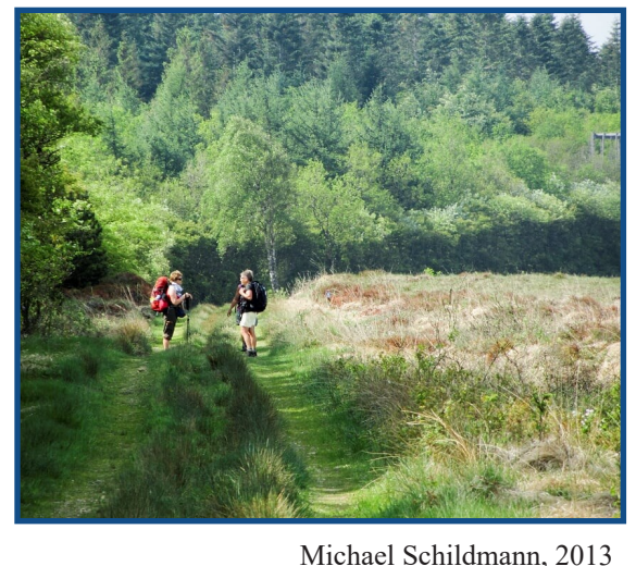
Witchael Semidinaliii, 2015

Figure 9: Walking and talking along the Way