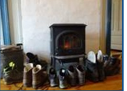
Anke Verwold, 2017

Figure 16: Pilgrim boots drying together around a shelter stove