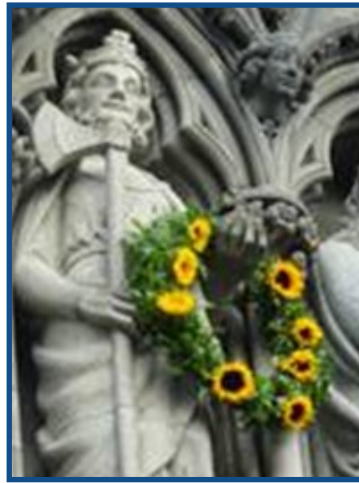
Figure 2: St. Olav (detail from the frontal façade of Nidaros)