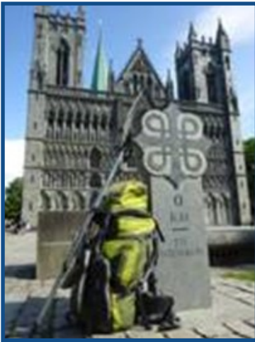
Figure 1: Nidaros Cathedral in Trondheim