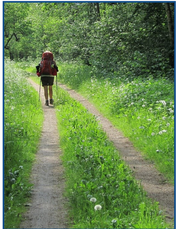
Figure 7: 'Self-immersing' / 'nature bathing' through the many woods along the route

I came to think about my divorce ... Quite a lot of anger and frustration came up in relation to