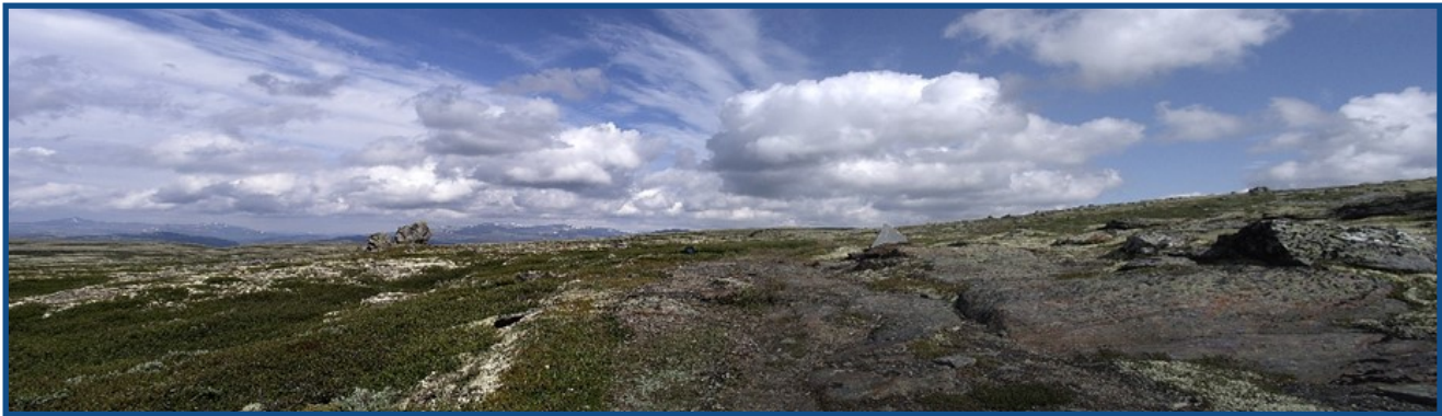
Figure 15: The Norwegian 'oceanic' plateau landscape