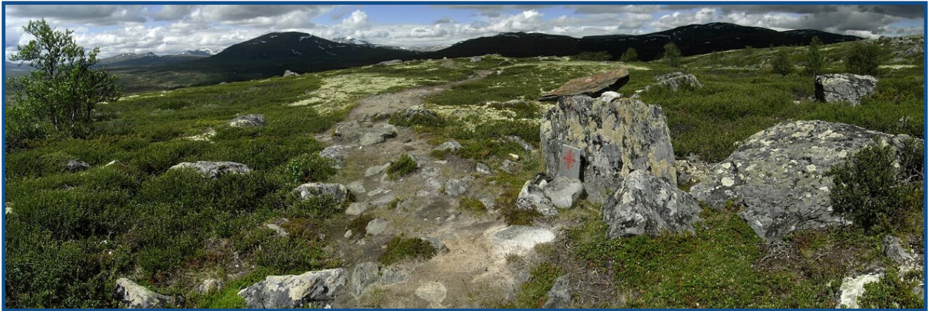
Figure 13: The St. Olav path crossing Dovre mountain