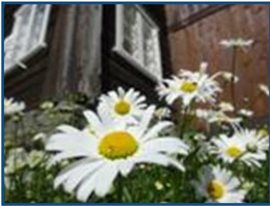
Figure 8: Daisies outside a shelter