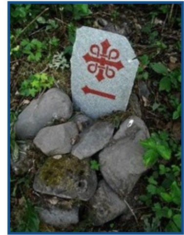
Figure 3: The St. Olav cross and Way symbol, often with a red arrow