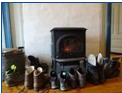
Figure 16: Pilgrim boots drying together around a shelter stove