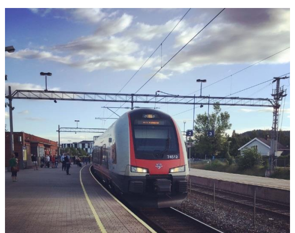
Figure 1. The Flirt train

In 2012, NSB, the Norwegian railroad operator (government owned) put 23 new train sets into service. The next day, customers started complaining about the seats being too narrow and uncomfortable. Due to massive complaints, NSB decided to change the seats for a cost of 51 million Norwegian crowns (almost 5 million Euro). The upgrade of the seats was finished in 2014 [16].