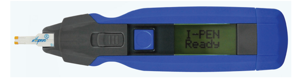
Figure 2 I-PEN

Tear osmolarity was measured with I-PEN (I-MED Pharma Inc.). The device is new on the market and has been validated only in minor studies (Chan, Borovik, Hofman, Gulliver, & Rocha, 2018). The I-PEN measures the tear film osmolarity quantitatively, directly from the tear volume on the surface of the inferior, lateral conjunctiva. The test pen is loaded with a single-use sensor, one for each eye. The test was performed with the patient sitting in the test chair. The right eye was measured first by gently pulling down the lower eyelid, instructing the patient to look up and left. While holding the device at a 45-degree angle, the tip of the I-PEN was gently placed on to the lower conjunctiva, slightly depressing the surface. The same procedure was repeated for the left eye with the patient looking in the opposite direction. An audible beep was heard when the measurement was completed. Osmolarity \geq 308 mOsm/L or an intraocular difference > 8 mOsm/L was defined as a positive diagnostic finding of dry eye. The value is a validated and widely used criteria for dry eye (Wolffsohn et al., 2017).