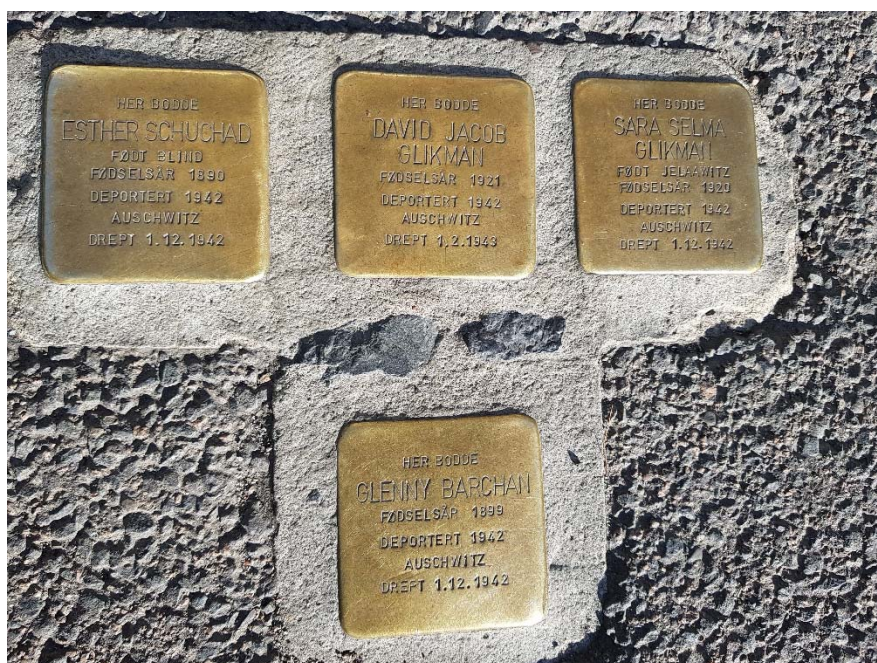
Image 2: “Cobblestones” project marking the residences and places where Jews were apprehended in Norway

Another example could be the project called Stolpersteine (German for cobblestones) started by the German artist, Gunther Demnig in 1993. The aim of the project is to lay bronze cobblestones all over Europe to commemorate the victims of National Socialism. “Since 2010, Oslo Jewish Museum and artist Gunter Demnig have been placing memorial cobble stones in memory of Jewish victims of the Holocaust in Norway” (Oslo Jewish Museum, 2018) (see image 2).