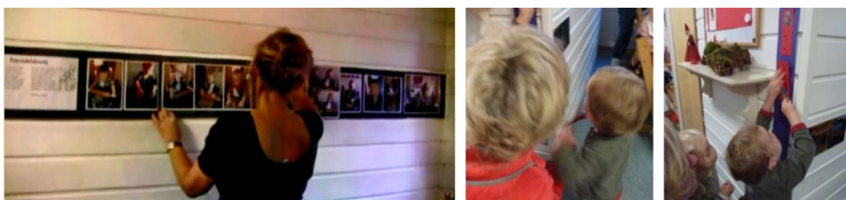
Figure 5: The use of documentation in kindergarten, Carlsen (2015, Figure 61, p. 317).

3. Still pictures from video describe the same phenomenon. The third and more descriptive use of video screenshots is to present them in the same way as the sequences of actions but in another context. The pictures are not necessarily linked together as parts of the same situation but describe the same phenomenon, thing or place. I give an example in Figure 5.