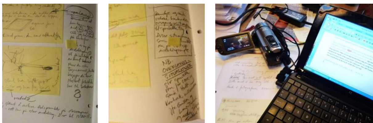
Figure 2: Daily tools in fieldwork, Carlsen (2015, Figure 15, p. 163).

The following description of experiences with visual tools in ethnographic research in early childhood education builds on Carlsen (2015). Inspired by the original anthropology researchers' 'black wax-covered fieldwork notebook', I purchased ten notebooks with blank sheets in A4 size to prepare the field notes, written and drawn. The first day in the preschool showed that this was completely impractical for use in an observational situation. The notebook was too big to handle, there was nowhere to place it other than on the knee, and the children were eager to see what the researcher was doing with the book instead of carrying on with their work and play. As a result, Post-It notes took the notebook's place as the daily tool for notes (ref. Kullberg, 2004). The notes were so small that it was possible to put them in the pocket when moving around. The limited space made the notes very compact, like keynotes, and sometimes as rough sketches of places and of children's positions in the room. Immediately after each observation pass, the Post-It notes were pasted into the notebook in the right order with comments, reflections and questions for the next observation pass or for conversations with the preschool staff. The whole observation session was written up in a digital logbook after the observation, with the Post-It notes and further notes as basis.