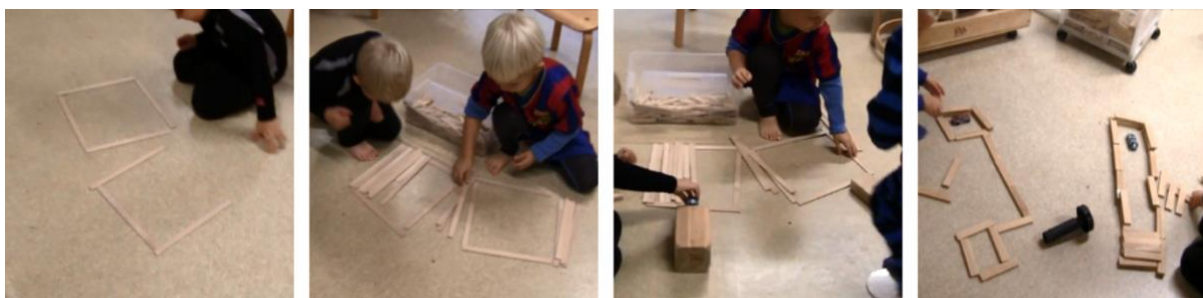
Figure 6: 'Someone is filming here...', from Carlsen (2015, Figure 51, p. 281).

Carlsen (2015) describes how a discreet message came from one boy playing together with two other friends. They played with small rectangular wooden blocks, in preschool normally named ' Kapplastaver ' after a Company name, and organised a topological landscape on the floor here Figure 6.