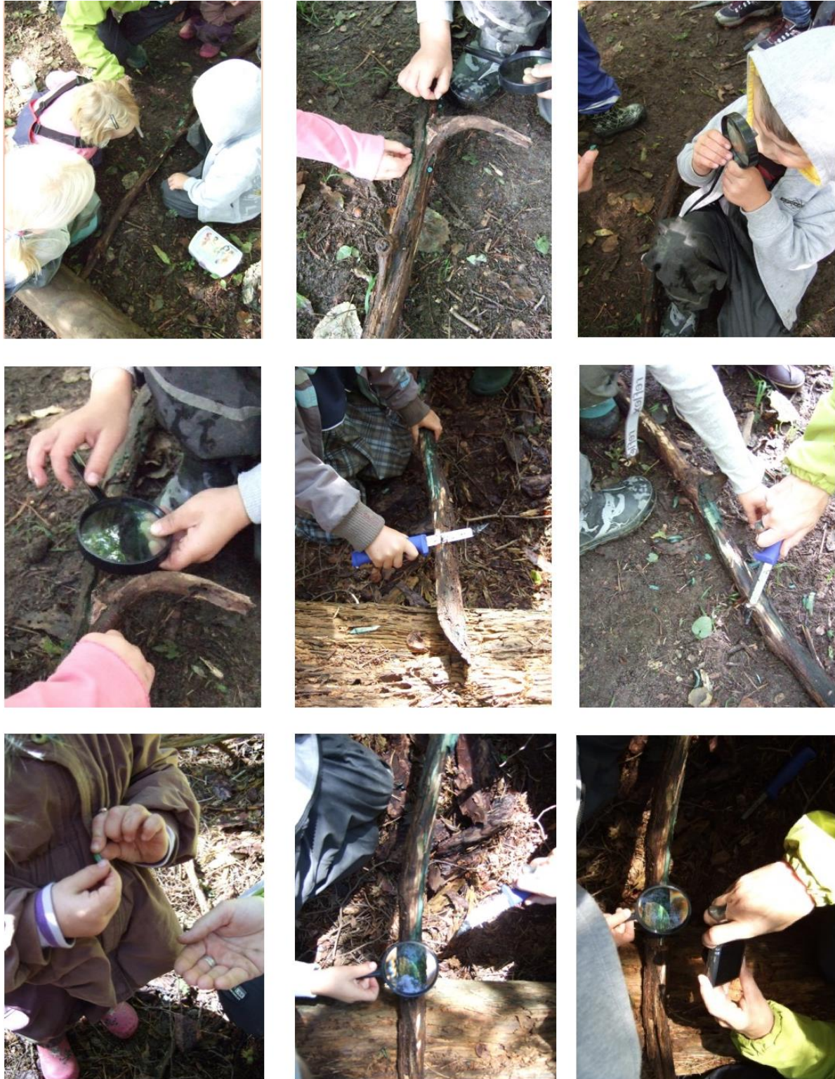
Figure 3: 'The green stick', Carlsen (2015, Figure 35, p. 222).

As an example, I use Figure 3, 'The green stick', where the photos are presented first and then commented on in the text.