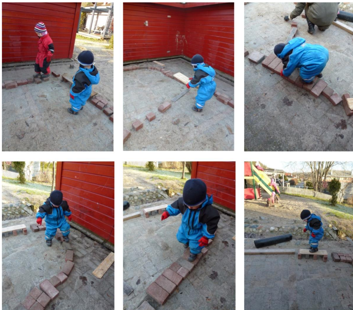
Figure 1: Work with, and use of, concrete pavement stones and wooden planks, Carlsen (2015, p. 215). All photos in this article are by the author.

In Carlsen (2015), visual data is analysed together with written text from documents such as field notes and transcriptions of sound recordings from focus group interviews. Here, I focus on the visual parts of the ethnographic research method, which in some of the chosen examples from the fieldwork also includes the interplay between empirical data from nonvisual sources and video recordings.