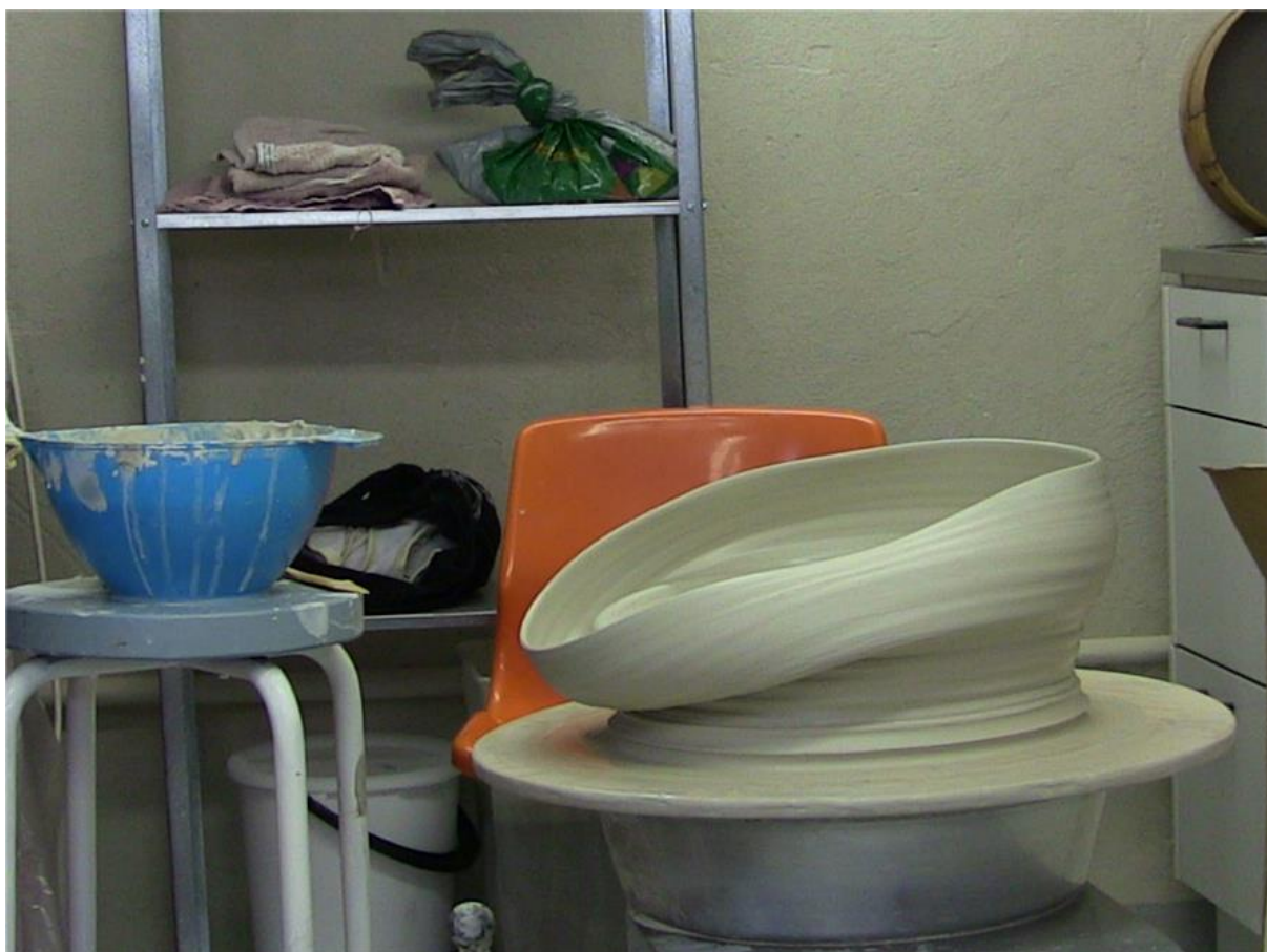
Figure 4: The results of a failed attempt to throw a clay bowl on a potter's wheel.

While arts and crafts can be practised alone, in educational and therapeutic situations the making process is interwoven with social interaction, in which emotions also play a crucial part. Dissanayake (2009, 158) claims that artistic behaviour assists the managing of difficult emotions in circumstances of uncertainty. In the context of art and design education, when young adults are still uncertain about their personal and professional identities, art and craft making has enabled students to ponder on these issues (Figure 5) and served as a method of finding their own way to proceed in their creative practice (Mäkelä & Löytönen 2017, 11–12).