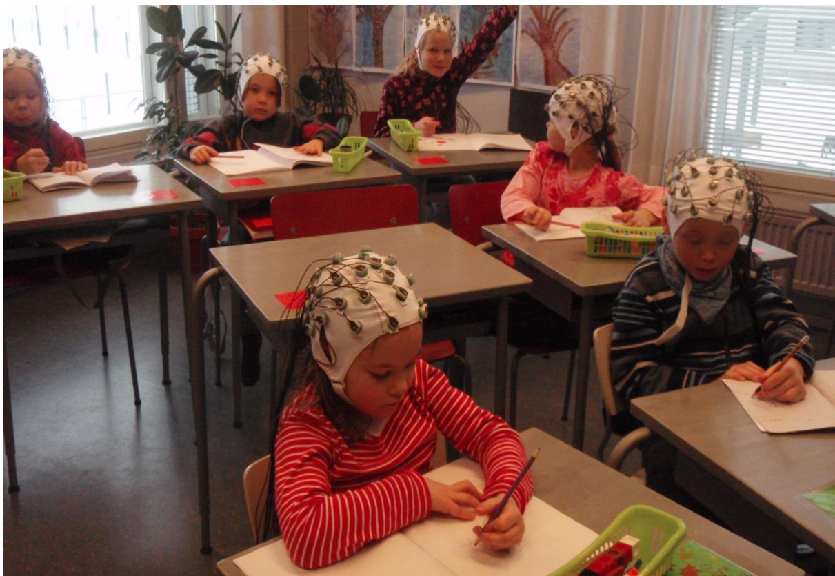
Figure 1: Finnish school children participating in a neuroscientific experiment (mobile EEG) in their natural environment at school.

approaches to the making process and its products.