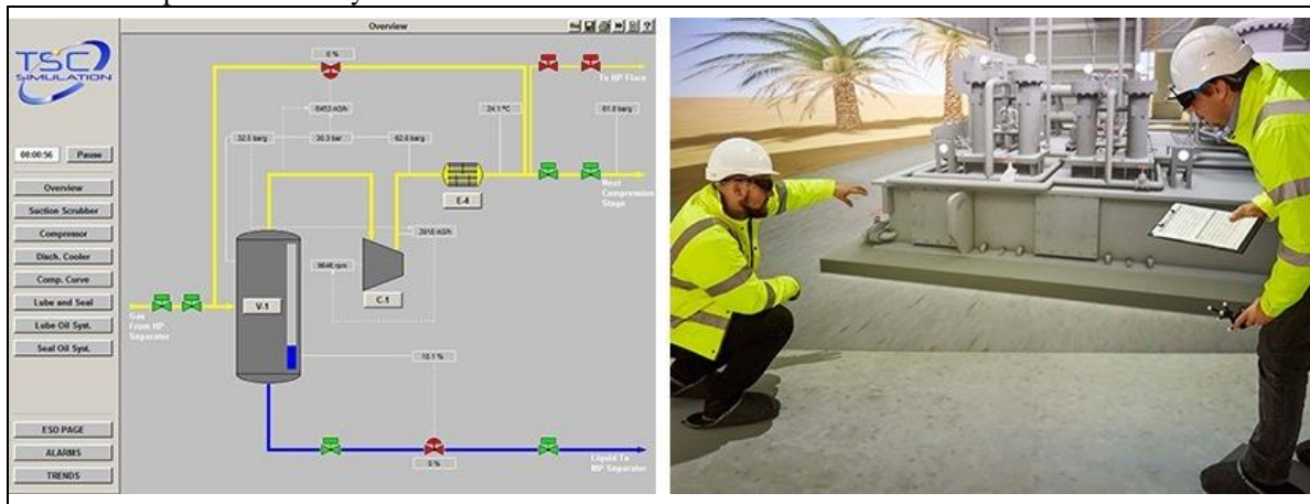
Figure 1: Process simulator by TSC Simulation is connected to the virtual reality environment I3TE by EON reality.

The literature search included companies that provide 3D/VR simulators for the chemical process industry. Other industries were outside of the scope of the search. The literature study is mainly based on the product datasheets available on the companies' websites.