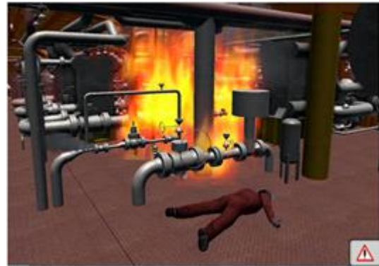
Figure 2: Emergency situation, Visualization of fire in COMOS Walkinside simulator [34].

performance. Generally, the assessment of performance is made by an expert assessor, which can easily be biased by his/her experience and knowledge. Therefore, objective performance measures ensure more robust, consistent, and unbiased assessments of performance.