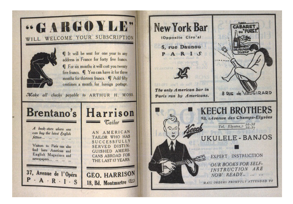
Fig. 3 Advertisement pages, Gargoyle , 1.1 (July 1921)