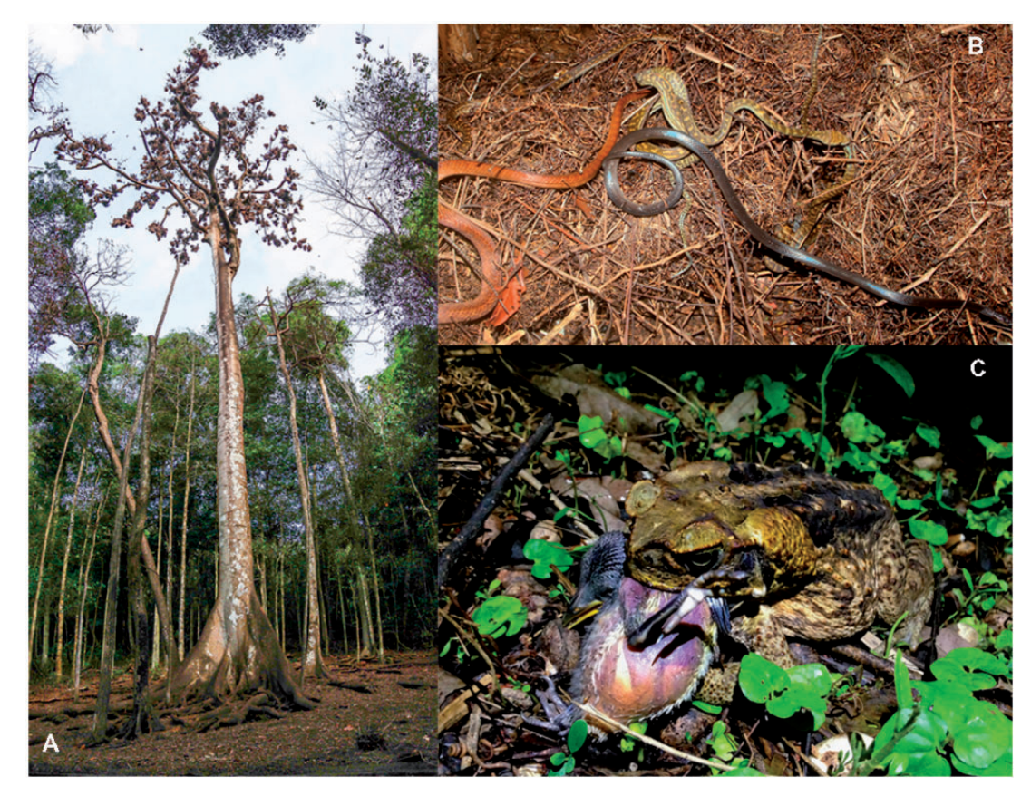
Figure 1. (A) An emergent rainforest tree with nests of metallic starlings, showing bare ground beneath the tree; (B) aggregation of predators at night beneath a bird-nesting tree, and (C) a cane toad Rhinella marina eating a nestling starling beneath a bird-nesting tree.

conspecifics found nearby along the edges of roads through the forest (henceforth, "road toads"). Both types of sites are examples of "ecological disturbance", but they differ in whether that disturbance was created "naturally" (by nesting birds) or anthropogenically (by road construction). The comparison is not ideal, because the areas beneath bird colonies and along roads differ greatly in shape (oval versus linear). However, detectability of adult toads was close to 100% in both of these very open habitats (Natusch et al. 2017a, 2017b). Neither of these habitat types is typical of the surrounding forest, and both are "disturbed" (but in different ways). We could not sample toads in the "undisturbed" forest, because we saw them there only rarely. That low rate of encounter partly reflects difficulty of detection, but a more important bias is that cane toads avoid dense vegetation, instead preferring open areas (both in the native range and in invaded areas: Lever 2001; González-Bernal et al. 2015). Thus, the only places where we could sample toads were the two types of disturbed areas: one affected by bird colonies and the other by human activities.