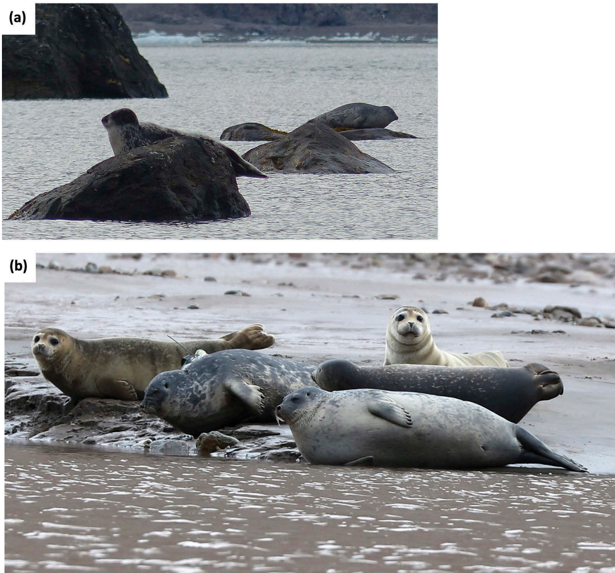
Figure 2. (a) Ringed seals hauled-out on rocks in Adolfbukta, Svalbard; note glacier ice in the background. (b) Three ringed seals (in the foreground – one with a Satellite Relay Data Logger) and two harbour seals in the background hauled out together on shore in St Jonsfjorden, Svalbard; the yellowish fur of the two harbour seals shows that they are still moulting.

pieces routinely. However, these glacier ice pieces never enter the lagoon because of its shallow entrance. It is assumed that the ringed seals come into the lagoon in search of ice platforms (sea ice in lagoons freezes up earlier and stays longer than fjord areas due to fresher water and less wave action) or perhaps food (Arctic char [ Salvelinus alpinus ]). However, in 2016 all five ringed seals tagged inside the lagoon hauled out on shore within the lagoon, while also using glacier ice deep in the fjord to some degree (Fig. 3). It is worth noting that in 2012, all of the tagged seals returned to the lagoon to haul out late in the season, following the formation of sea ice, which they used as a haul-out platform.