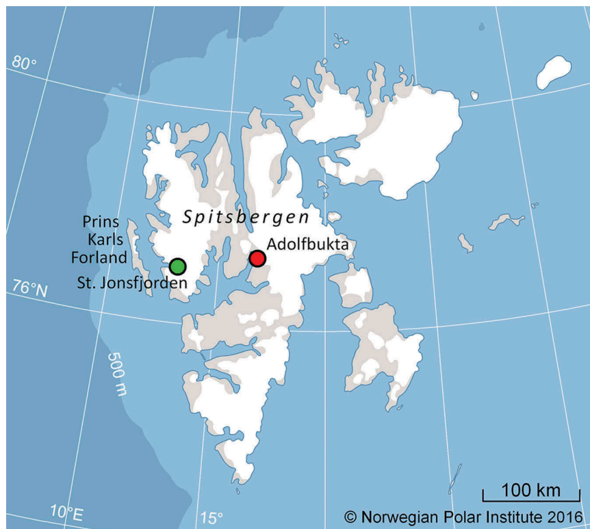
Figure 1. Map of Svalbard where place names mentioned in the text are indicated. The red dot is where the ringed seals in Fig. 2 (a) were hauled out and the green dot is where the mixed group of ringed and harbour seals in Fig. 2 (b) were hauled out.