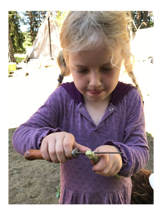
Figure 5. Making a flute.