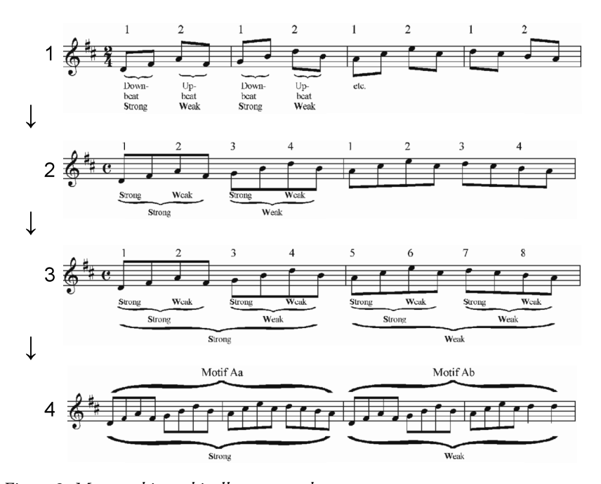
Figure 9. Meter as hierarchically structured.

The basic idea is that the organizing pattern is mirrored on increasingly higher levels in the musical structure (Sachs 1953; Cooper & Meyer 1960; Klapuri 2003). If we say that the pattern 1 in figure 9 below consists of the two phases strong and weak, this alteration could be said to reoccur in different ways on different hierarchical levels. If the same musical pattern is represented like in 2, it is seen that the repetition of the strong-weak pattern forms a larger pattern of four accents in which the one-two group is stronger than the three-four group. On the next level (version 3), the first part of the melodic-rhythmic motif (one-two-three-four) is stronger than the second part of the motif (five-six-seven-eight). Extending this principle to a larger motif (version 4), we might say that the A-part of the motif is stronger than the B-part. And so on. Many scholars have argued, however, that at structural levels that exceed the capacity of direct perception, listeners perceive form rather than rhythm or meter (Clarke1999).