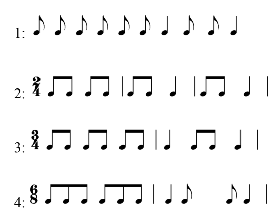
Figure 4. Different metrical organizations of the same sequence of sounds.

Let's assume that waltz is a meter. Let's also assume, without including this in the proposed definition, that we recognize the waltz meter by the repeated pattern One -two-three, One -two-three and so on. In this example, all One -two-three cycles have the same metrical status or function. For instance, if the music is used for dancing, we may start the dance from any of these One's. Moreover, although there are an infinite number of waltz melodies, each performed in a number of different ways by different musicians, all these realizations of the waltz meter are in principle metrically equivalent. That is, they are all recognizable by the inferred recurring One -two-three cycle, and we may start our dance in the middle of any of them.