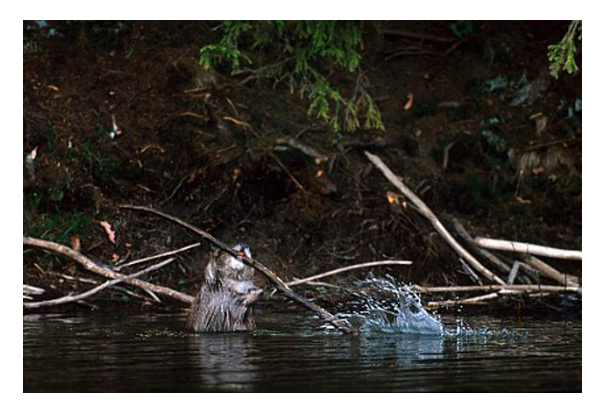
Fig. 1 Beaver performing stick display at a territory border.

splashing of water. However the sound of StD would not carry very far compared to tail slapping (another signalling behaviour, see below).