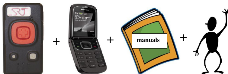
Figure 1 “PPAP” – transmitter, cell phone, manuals and support person.

All subsequent data collection occasions followed a specific pattern (Figure 2). First a joint informal conversation with the person with dementia and his/her spouse took place, where the couple summarized what had happened in their daily life, in relation to use of the PPAP, since the previous data collection occasion (Part 1). Then the person with dementia went for an outdoor walk, during which he/she was encouraged and instructed to walk as he/she normally did when alone. During this walk, an informal conversation was conducted with the person with dementia