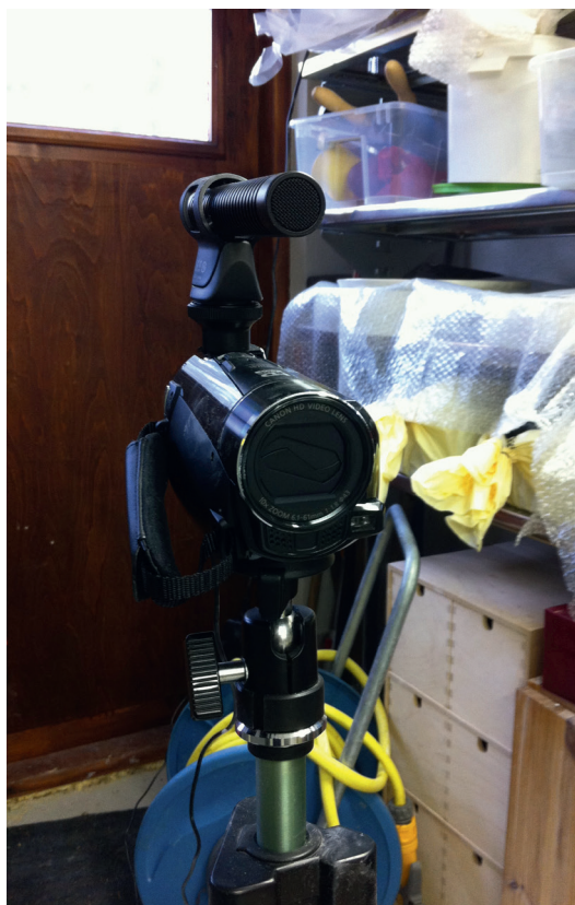
Figure 2: The video camera used for documentation of the studio-based case presented in this chapter.

data, such as the audio-visual format, is useful.