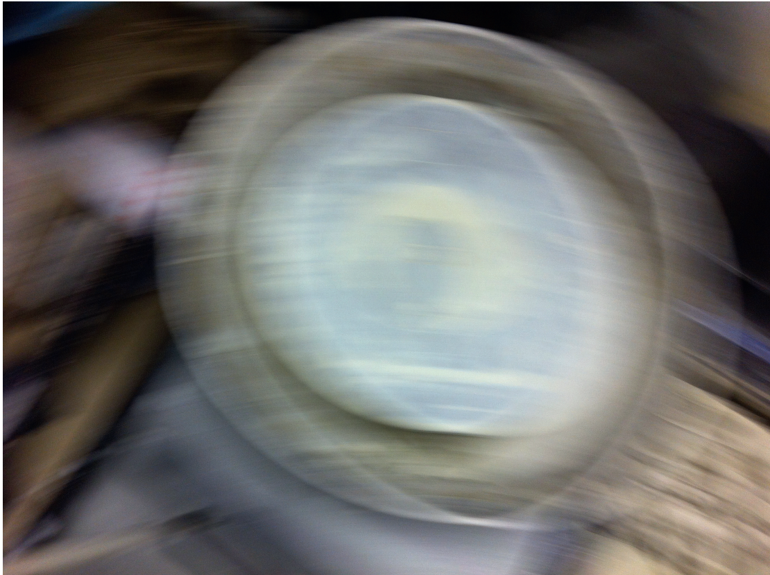
Figure 1: Potter's throwing wheel in rotation, as an example of the fast and fleeting nature of experience.

practitioner's full attention. Collecting data from the act of practicing the craft, while practicing, is thus another challenge. However, these difficult circumstances should not inhibit practitioners from researching their practice, and through the new generation of practice-led researchers, new methods and ways of studying practice, through practice, are emerging. The use of video-documentation in particular is one way of capturing and documenting events and related experiential knowledge.