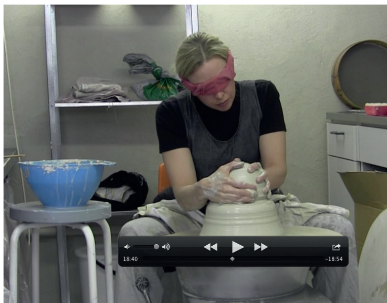
Figure 4: Screenshot from the video while conducting video-supported protocol analysis, looking at each second separately and noting what was said and what actions were made.

I had been blindfolded during the event, I did not have any visual memories from the events of throwing clay (Figure 4); however, by looking at the video I remembered the different stages in the process very vividly and the video worked as a recall interview with the situation (Geiger, Muir, and Lamb 2016). The memories were felt in my body and I could more easily remember how the different movements and actions had felt at the time and why those actions were inevitable at the time.