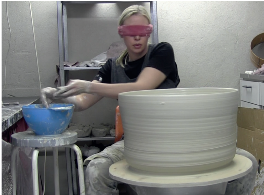
Figure 3: Screenshot from a video recording while throwing clay blindfolded. Click the image to see the video if reading a pdf version, or scan the code or go to: https://youtu.be/bK8joRULsjU .