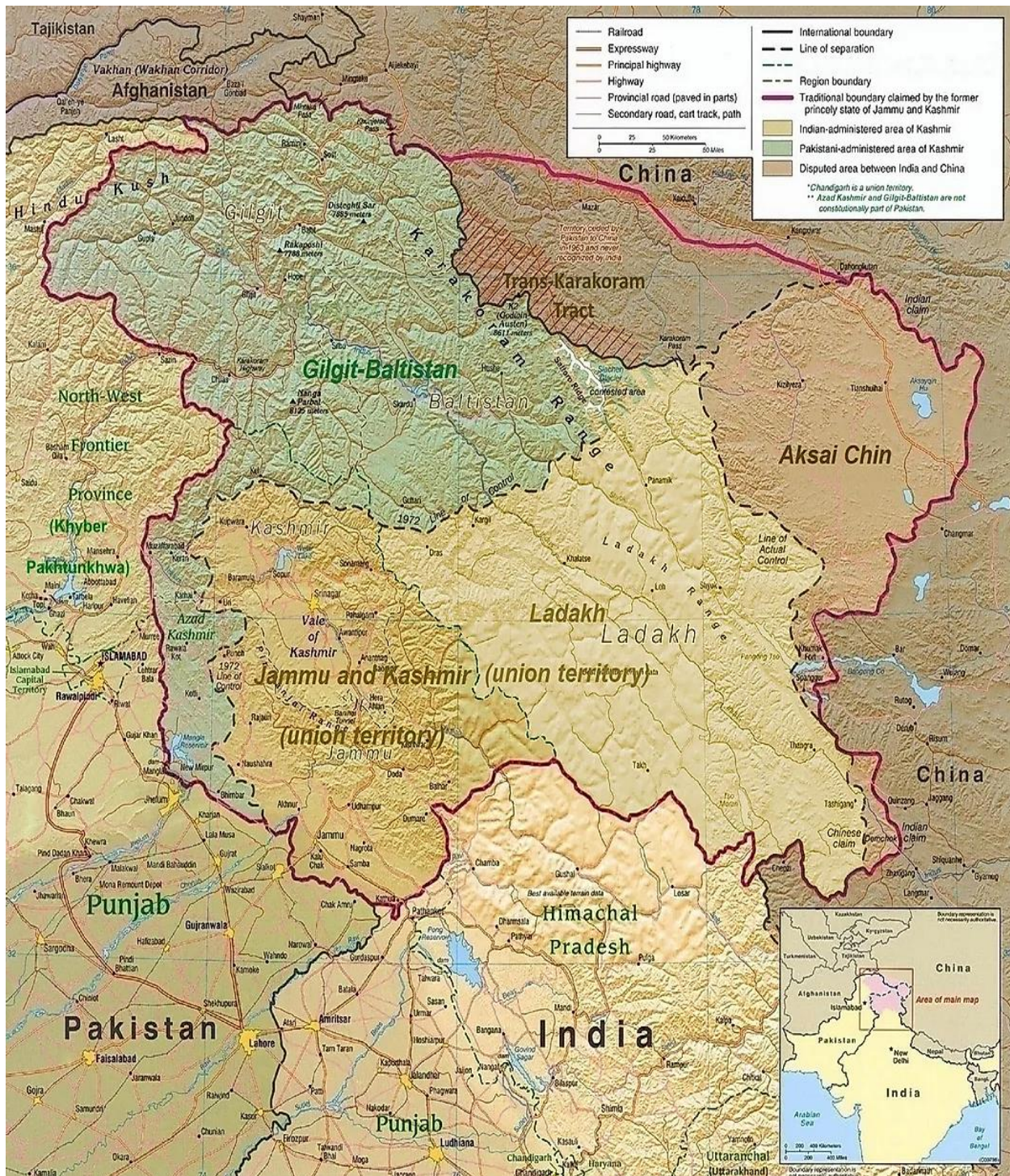
Map 1. Figure 1A map of the disputed Kashmir region created by the US Central Intelligence Agency and hosted by the University of Texas-Austin Perry-Castaneda Library Map Collection; altered to show new jurisdictions by Fowler&fowler.

The people of Kashmir speak a language that is different from the languages spoken in India and Pakistan. Along with Urdu and Hindi being most common languages in two countries, people of