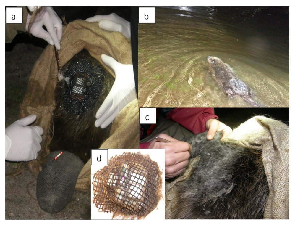
Fig 1. Process of tagging a Eurasian beaver ( Castor fiber ) using glue-on tags within the study area in southeastern Norway. Attachment of the tag using two-component epoxy glue (a), release of the beaver with the tag attached (b), removal of tag by cutting it out of the outer fur using a scalpel (c), and the tag following removal (d).

https://doi.org/10.1371/journal.pone.0261453.g001