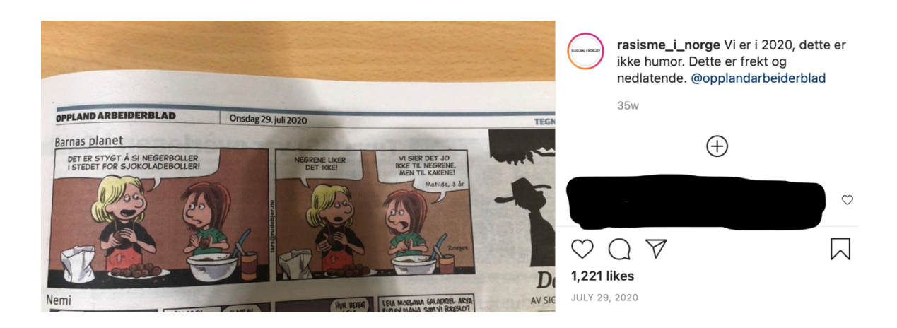
Text 3. Published 29 July 2020. The cartoon says, in English, its bad to say nigger bun, instead of chocolate bun (from picture one of the cartoon), Niggers don't like it. But we don't say it to niggers, but to the cakes. (from picture two of the cartoon).