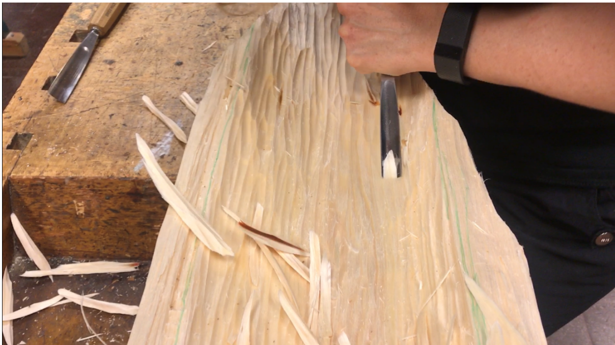
FIGURE 4. Carving purkinje #4, April 2018.

A problem with the deductions in these three topics is that, in this initial state, they are only tentative ideas. As such, they could be regarded as ‘new, modern gloss on some very old ideas’ (Wall, 2014, 12 th paragraph). A rigorous study is needed for us to know how deductions such as these hold up when analysed and translated between the layers of complexity and between disciplines (Donoghue & Horvath, 2016). In the terminology of Donoghue and Horvath (2016), it is possible to argue that the deductions in the current article indicate a downward compatibility between the layers: that the individual carvers’ experience, as presented in the introduction, is compatible with the aspect at the organ- and cell layers of complexity that were described. However, it is necessary to emphasise that the processes described at the organ and cellular levels are only a small part of an individual’s complex experience. Therefore, from such a lower level, it is impossible to predict what would happen on the higher individual and sociocultural levels if more processes in the interwoven nervous system were described.