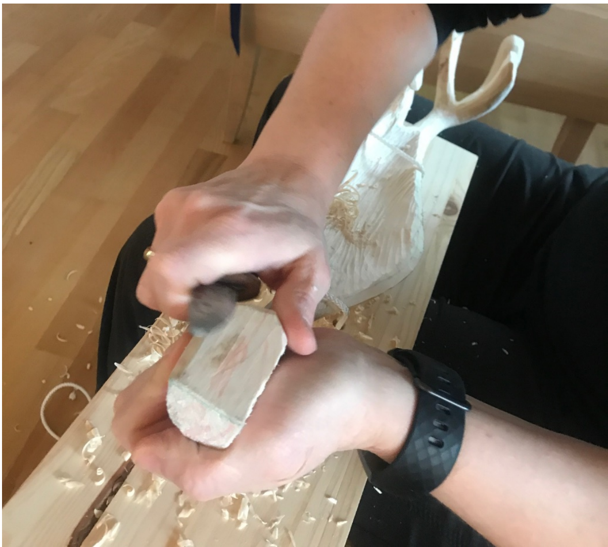
FIGURE 1. Carving Purkinje Box #1, March 2020.

The wood needs a long period of intense persuasion to accept my ideas, and my ideas need time to adjust to the wood. But when the shapes are found at last, the knife follows the directions of the fibres. When they meet, the fibres and the knife, they unite like rivers connect, meet gliding down through shallow valleys.