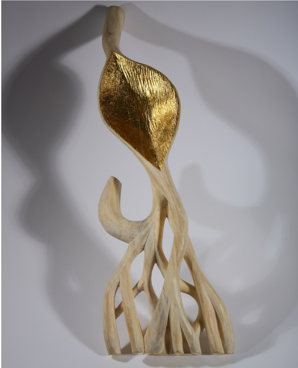
FIGURE 3. Bowl #3 in Purkinje-series, inspired by the Purkinje cells in the cerebellum, 44cmx12cmx6cm. Made by Gulliksen, 2018.