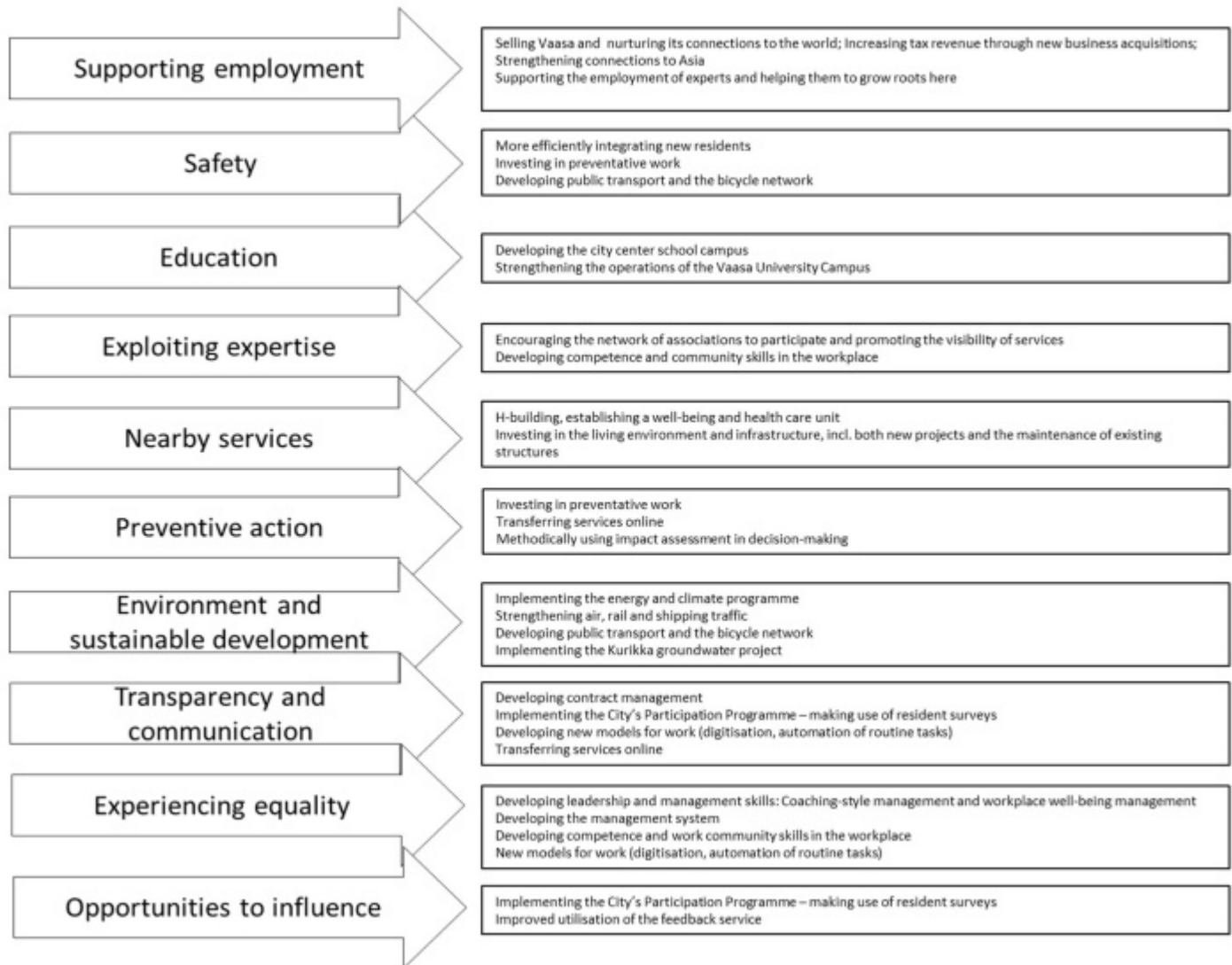
Figure 2. Connections between the top ten areas Vaasa should invest as defined by citizens and the strategic actions the city committed in its strategy work.