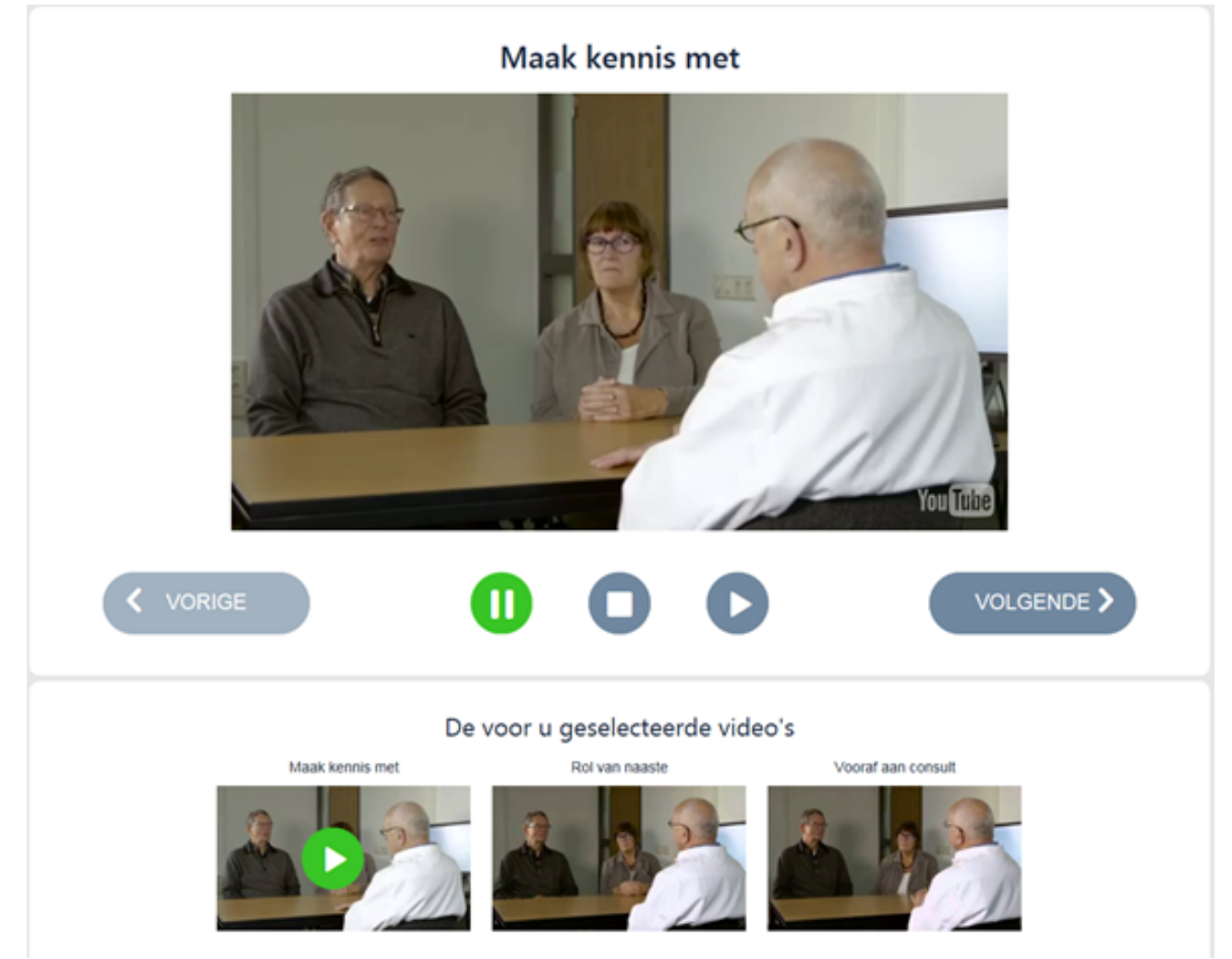
Figure 1. Screen captures of ListeningTime video fragments.