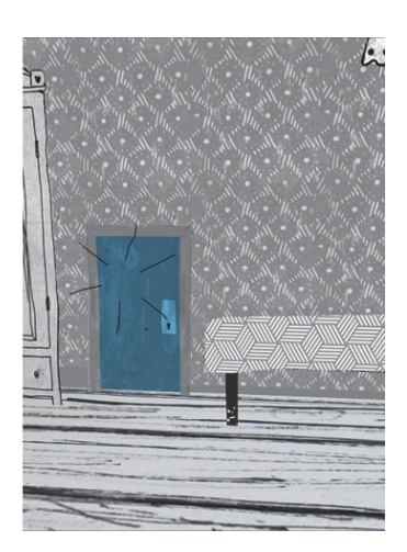
Figure 1. Illustrations from the Wuwu & Co. app © Step In Books, 2014.

Below, we explore this by asking the research question: How is touch interaction with a picturebook app facilitating or limiting sensemaking? We conducted an in-depth explorative inquiry on one case in particular—an award-winning picturebook originally published as an app, Wuwu & Co.