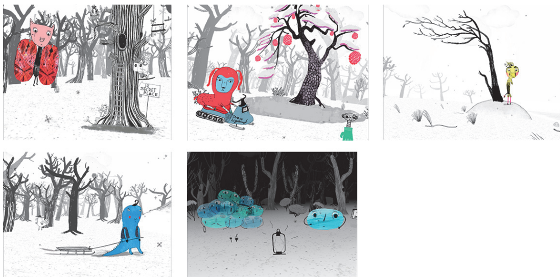
Figure 2. Five characters: Everett, Thit Maya, Wuwu, Pruney, and Storm. © Step In Books, 2014.

for children by Step In Books (Helle & Slocinska, 2014). Choosing a children’s picturebook as research context is useful, even though sense-making with picturebook apps is a general issue for both adults and children, because children are more avid readers of picturebooks. Wuwu & Co. is a fictional, illustrated world, complete with an integrated soundscape, narrator, and text. The narrative follows five creatures who need help during a cold winter. The narrative plays out in five different scenes, one for each character (Figure 2).