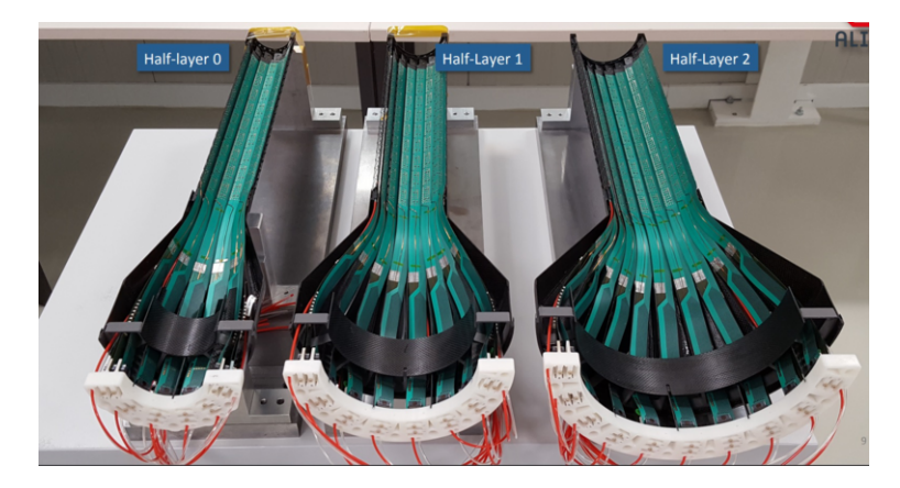
Fig. 1. Photograph of the upgraded ITS inner half-layers