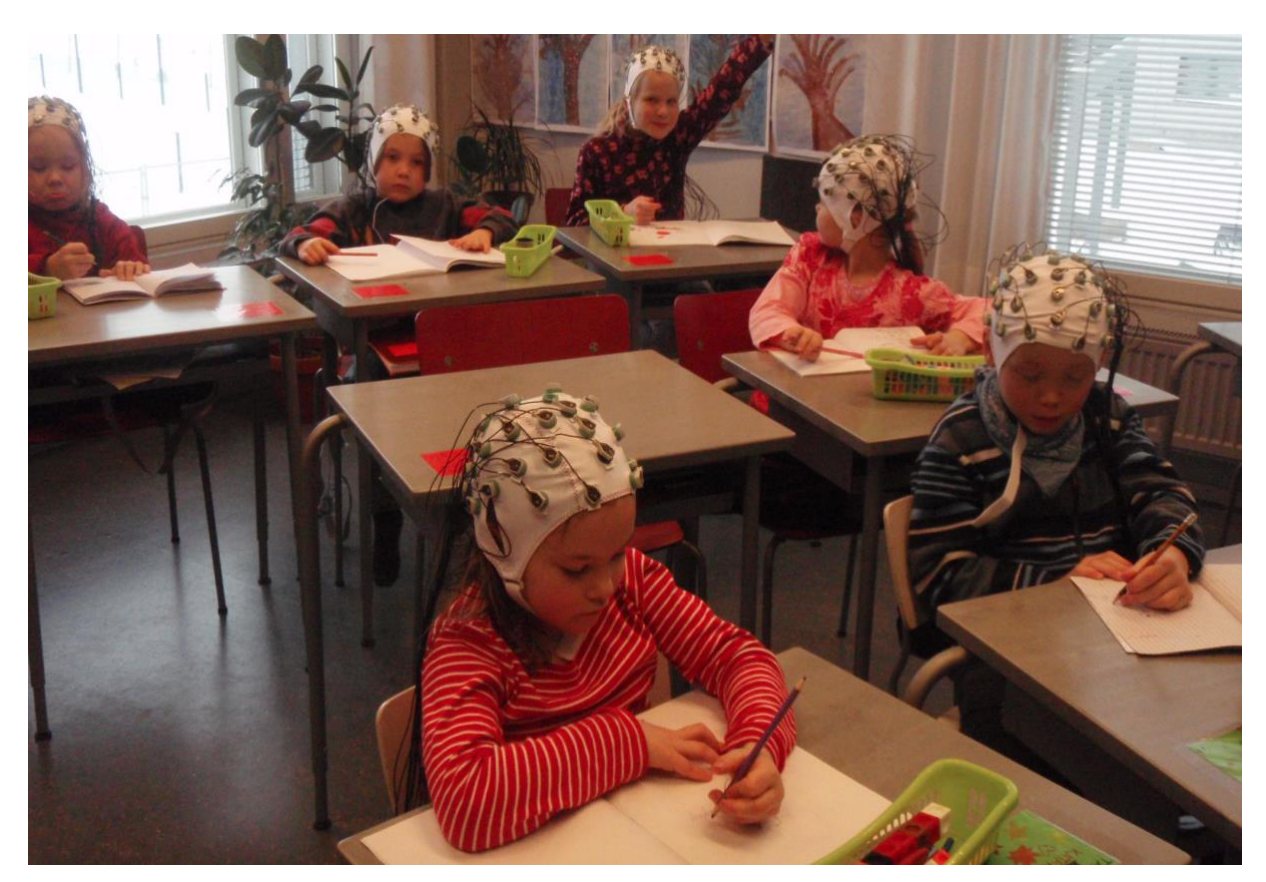
Figure 1: Finnish school children participating in a neuroscientific experiment (mobile EEG) in their natural environment at school.

approaches to the making process and its products.