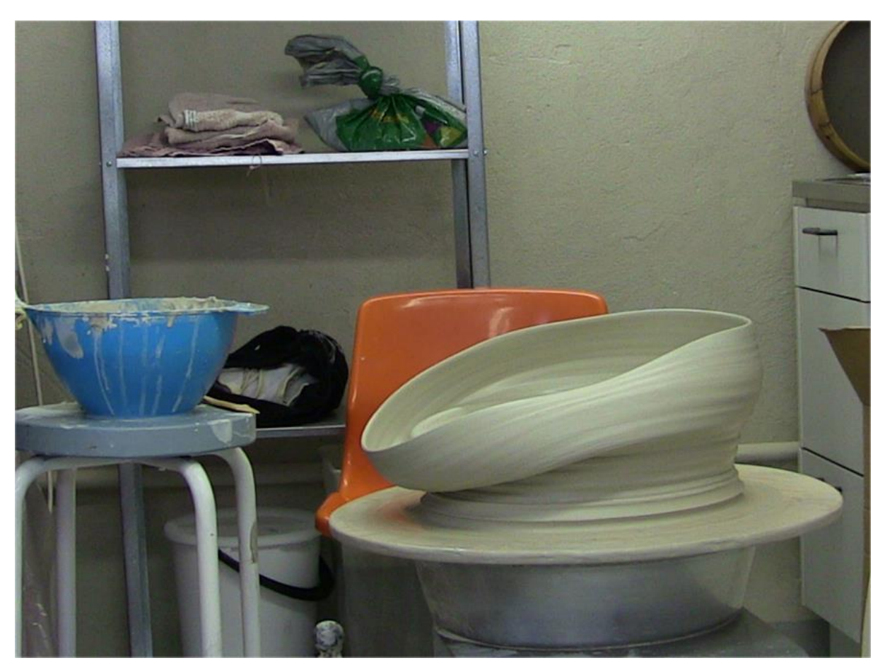
Figure 4: The results of a failed attempt to throw a clay bowl on a potter's wheel.

While arts and crafts can be practised alone, in educational and therapeutic situations the making process is interwoven with social interaction, in which emotions also play a crucial part. Dissanayake (2009, 158) claims that artistic behaviour assists the managing of difficult emotions in circumstances of uncertainty. In the context of art and design education, when young adults are still uncertain about their personal and professional identities, art and craft making has enabled students to ponder on these issues (Figure 5) and served as a method of finding their own way to proceed in their creative practice (Mäkelä & Löytönen 2017, 11–12).