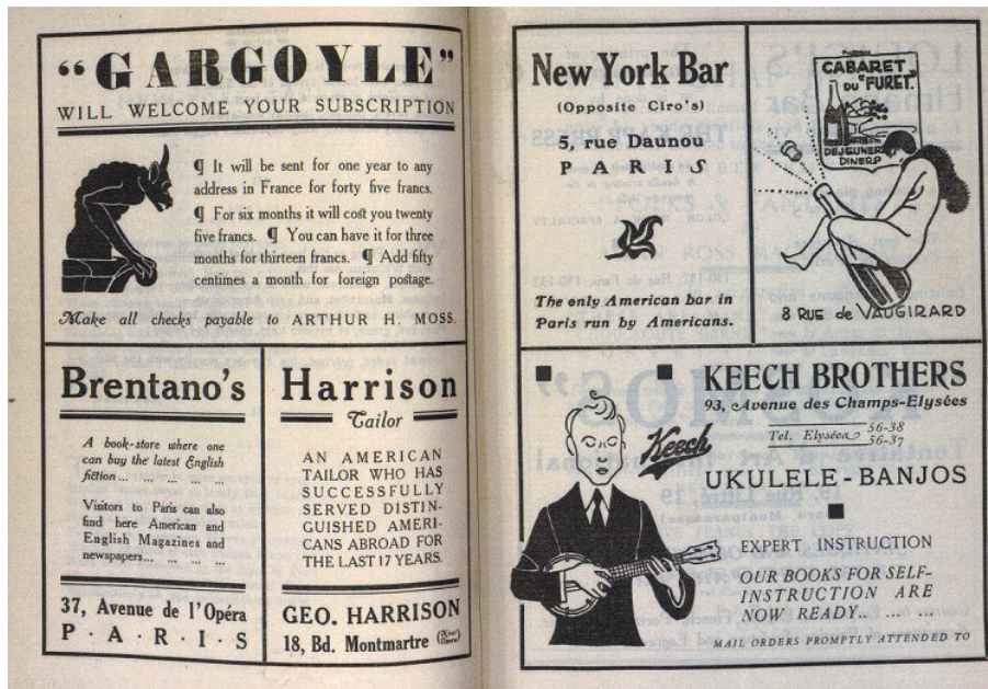
Fig. 3 Advertisement pages, Gargoyle , 1.1 (July 1921)