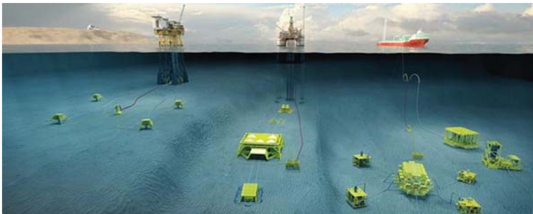
Figure 1: Illustration of subsea production systems at different sea depth levels.

Domain. Subsea production systems (SPSs) control and collect the flow of hydrocarbons from subsea wells to a floating offshore unit or to an onshore facility. SPSs are unmanned underwater systems that typically consist of subsea x-mas trees (valve arrangements), subsea manifolds, subsea templates, and pipelines (Figure 1). A control room on an offshore unit or an onshore facility controls the production