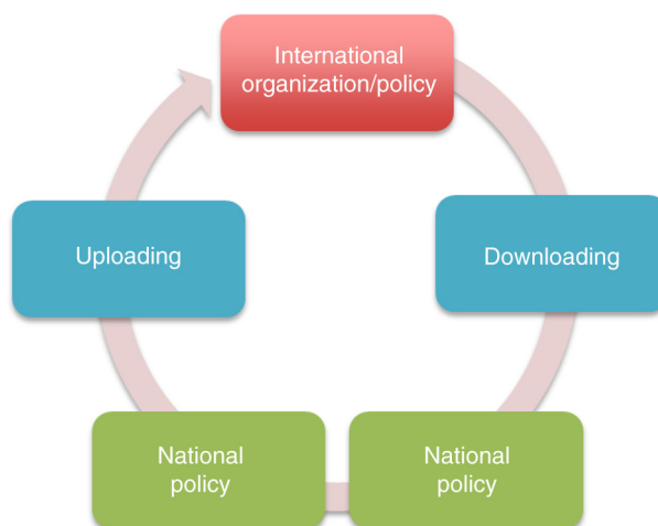
Fig. 1. Sequential approach of downloading and uploading (figure inspired by Börzel & Panke, 2013).

The literature offers several explanations for how member states become successful uploaders. Studies have shown that the share of votes a member state (their power) has in the EU is important but that this does not determine processes because informal institutional consensus norms