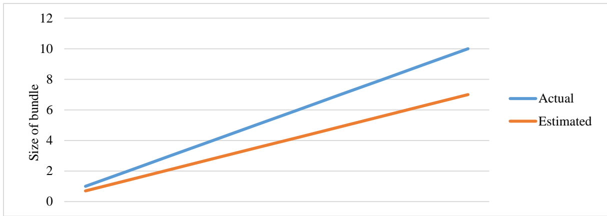
Figure 1 Illustration of deviations between actual and estimated bundle size at an exponent of .7

Figure 1 illustrates that as bundle size increases, the relative difference between the subjective perception of bundle size and the actual bundle size also increases. This implies that a consumer's tendency to under-estimate the value of a bundle will increase with increasing bundle size. Chandon and Wansink (2007) found a similar effect in a study of meal size estimation. They showed that as meals increased in calories, participants' subjective calorie estimations increased by only .73. This finding was consistent across different groups of consumers.