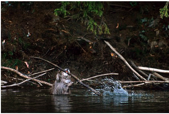
Fig. 1 Beaver performing stick display at a territory border.

splashing of water. However the sound of StD would not carry very far compared to tail slapping (another signalling behaviour, see below).