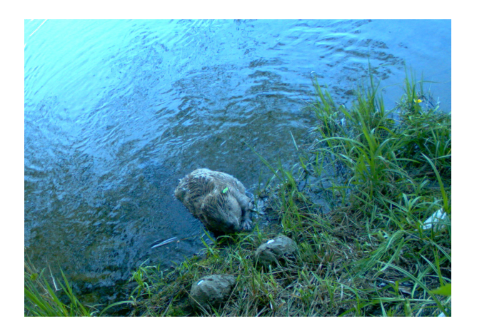
Fig. 1: Experimental setup with ESM containing male and female AGS and a responding dominant resident.

The 30-cm separation distance between ESM enabled beavers to differentiate between the scents and provided the opportunity of responding initially to one ESM then separately to the other. It also prevented the destruction of the second ESM during response to the first (Sun & Müller-Schwarze 1997; Rosell & Bjørkøyli 2002). Simultaneous presentation controls for temporal variation in motivation of the resident and thus provides a more sensitive test of discriminatory abilities (Sun & Müller-Schwarze 1997; Rosell & Bjørkøyli 2002; White et al. 2003).