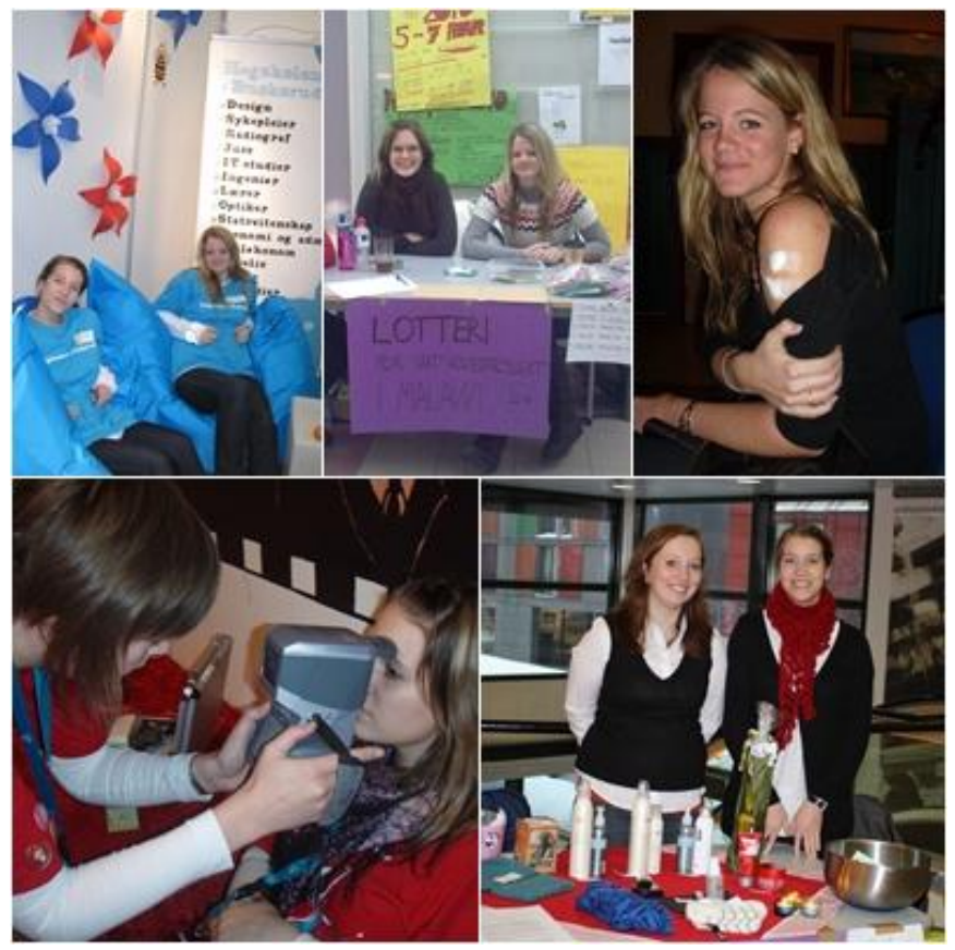
Exhibitions, raffles and vaccination

One of the first things we did at Mzuzu University was to make a schedule with the subject we were going to teach in. We spent the afternoons going through the teaching program and made sure that we all explained the procedures in the same way. Since the students where not that experienced, we had to start with the preliminary tests. We also spent a lot of our time making tests; both practical and theoretical.