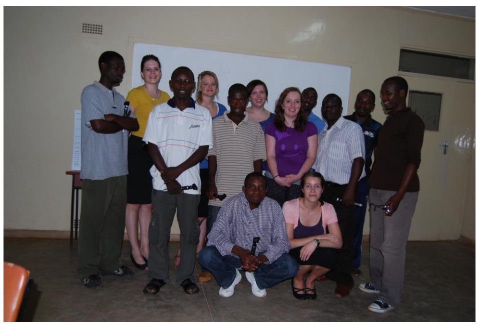
The Malawian and Norwegian optometry students