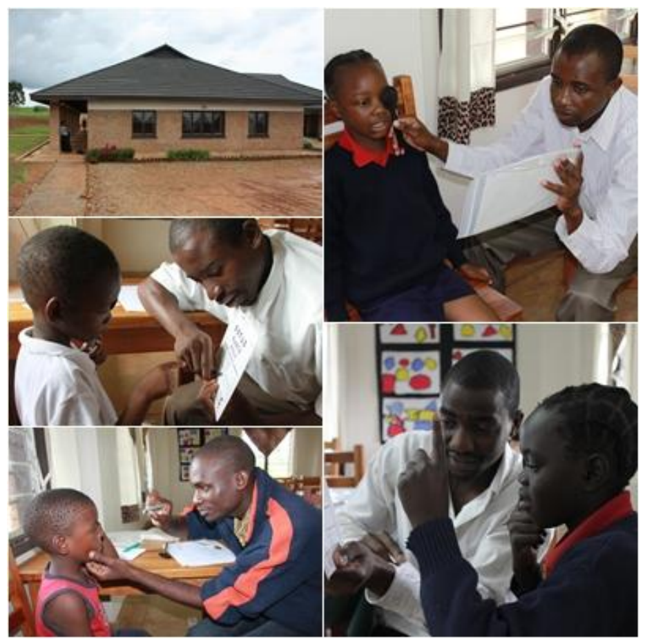
Screening at Rafiki

The last day at Mzuzu University, we organized "Optometry Olympics" for the students. The students were tested in everything they had learnt; preliminary tests and refraction. We set up different stations where they were tested in cover test, motility, retinoscopy, theoretical principles and pd-measurement. They were timed, since we had been training on doing the tests as fast as possible. At the end we had a medal ceremony, where the winners got prices, and everyone got medals. We ended the Optometry Olympics with the national anthems of Malawi, South Africa and Norway. This was a great way of ending the weeks of a great collaboration, where all of us had got new impressions, motivation and an incredible experience.