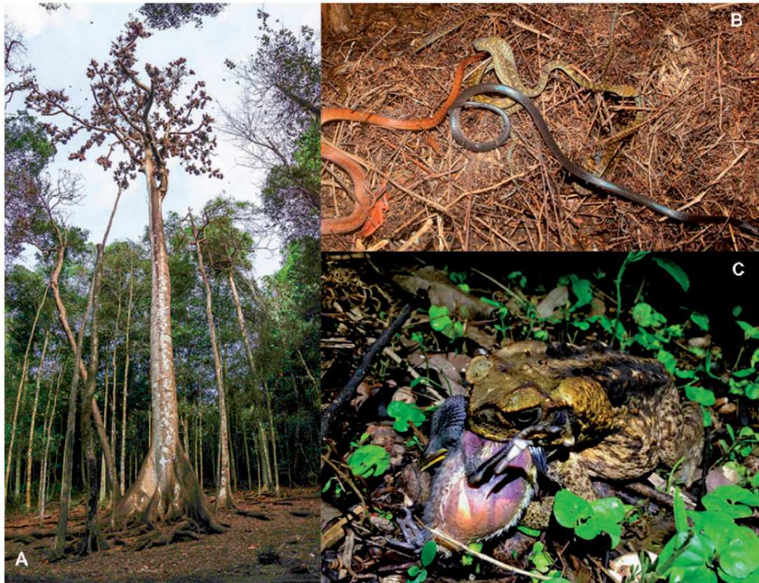
Figure 1. (A) An emergent rainforest tree with nests of metallic starlings, showing bare ground beneath the tree; (B) aggregation of predators at night beneath a bird-nesting tree, and (C) a cane toad Rhinella marina eating a nestling starling beneath a bird-nesting tree.

conspecifics found nearby along the edges of roads through the forest (henceforth, “road toads”). Both types of sites are examples of “ecological disturbance”, but they differ in whether that disturbance was created “naturally” (by nesting birds) or anthropogenically (by road construction). The comparison is not ideal, because the areas beneath bird colonies and along roads differ greatly in shape (oval versus linear). However, detectability of adult toads was close to 100% in both of these very open habitats (Natusch et al. 2017a, 2017b). Neither of these habitat types is typical of the surrounding forest, and both are “disturbed” (but in different ways). We could not sample toads in the “undisturbed” forest, because we saw them there only rarely. That low rate of encounter partly reflects difficulty of detection, but a more important bias is that cane toads avoid dense vegetation, instead preferring open areas (both in the native range and in invaded areas: Lever 2001; González-Bernal et al. 2015). Thus, the only places where we could sample toads were the two types of disturbed areas: one affected by bird colonies and the other by human activities.